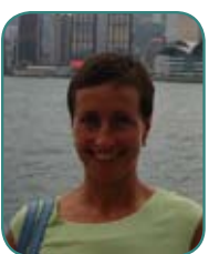
by Lori Grant

In 2001, a U.S. Supreme Court decision had the potential of dooming tens of millions of acres of wetlands nationwide to the bulldozer. Wisconsin conservationists turned that window of vulnerability into a window of opportunity and scored a significant and remarkable conservation victory later that year.