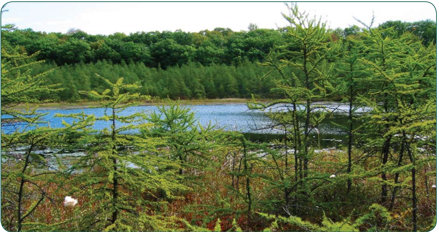
Buelah Bog, a wetland in Walworth County

Look for details on these mining activities in upcoming editions of our e-newsletter, Word on the Stream.