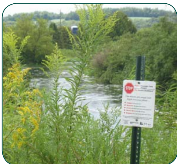
This sign, developed by River Alliance for posting on Dane County trout streams such as Black Earth Creek, pictured here, tells anglers how to keep their fishing act clean and free of invasives.