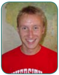
by Chris Clayton

In 1976, 55 million tons of zinc-copper sulfide ore were discovered at the headwaters of the Wolf River, and Exxon Minerals, a subsidiary of Exxon Corporation, wanted to construct a mine. Exxon Mobil Corporation has consistently been one of the largest companies on the planet, with $310 billion in revenue in 2009. With influence and power to spare, Exxon only needed the proper permissions to move the project forward.