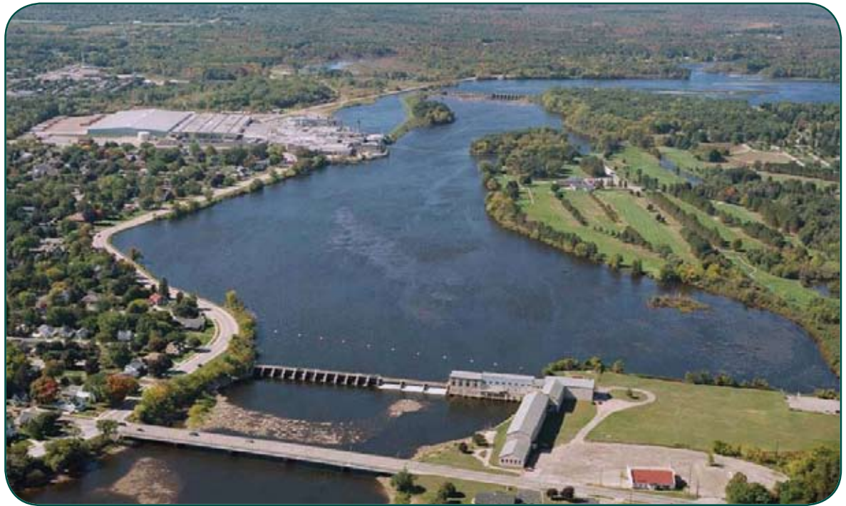
This is an aerial view of the two dams on the Menominee River at Marinette, Wisconsin and Menominee, Michigan that are the object of the sturgeon passage project funded by the Great Lakes Restoration Initiative and involve the River Alliance. When the project is fully realized, lake sturgeon will be able to move, unimpeded, around both dams seen here. The dams are owned and operated by North American Hydro.

In 1900 Chicago accomplished an astounding engineering feat. In the largest earth-moving effort undertaken in North America at the time, they disintegrated the watershed boundary between the Great Lakes and the Mississippi River. The impetus for constructing a 12-mile canal linking the two was a series of major typhoid outbreaks in the mid 1800s caused by sewage buildup along Chicago's Lake Michigan waterfront from where the city also drew its drinking water. The idea was to reverse the flow of the Chicago River to carry water from the Great Lakes to the city, then discharge the water (now wastewater) via the newly constructed canal to the Illinois River, which runs to the Mississippi.