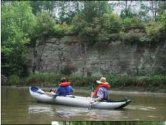
Inflatable canoes from Boo Canoe and Raft. Above: Members float past Baraboo bluffs. Right: Beached boats.