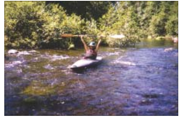
Helen Sarakinos shoots the rapids on the Brule.