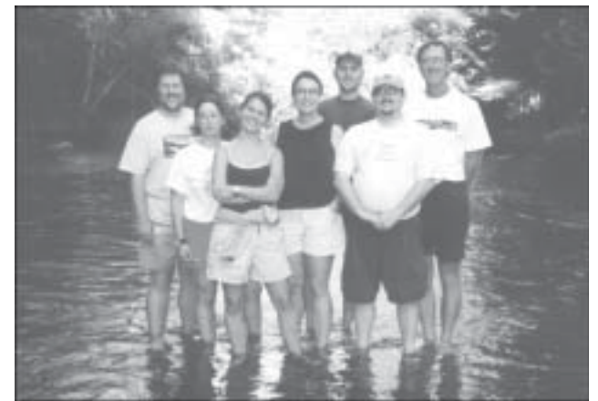
River Alliance staff at their 2003 Staff Retreat on the Brule River in northwestern Wisconsin. See more of our summertime activities on the back page.