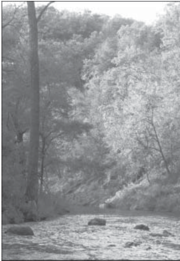
Kinnickinnic River downstream of River Falls.

A key to KRLT's success is their broad integration in the community, "I definitely think land trusts should be more involved in the hunting and fishing community...especially in rural areas, they're a very strong constituency" observes McMonagle, himself a hunter and