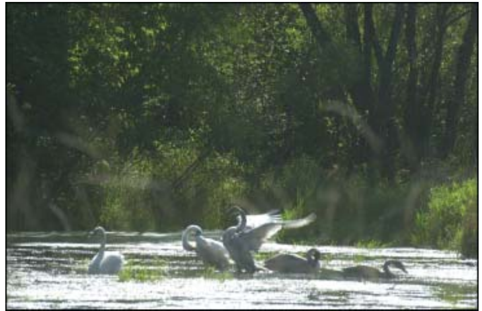
Swans on the Kinnickinnic River, featured on page 5.