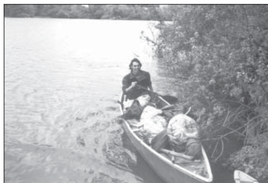
A Kinnickinnic River Land Trust volunteer at a recent Kinni clean up.

We may think that our environmental protections have progressed since the first Earth Day, and they have, but so has our power to radically transform the environment and alter its integrity. The tale of urban rivers is not a good read, and the costs of reviving a city creek are very high. We must come to our senses and protect what will be lost before it's too late. Our dream is a trout filled stream, teaming with life and flowing quickly and cleanly to the sea. An ocean of possibilities is open before us.