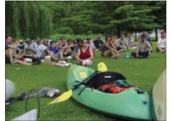
Lunch break on the Baraboo, 2003 paddle Party.