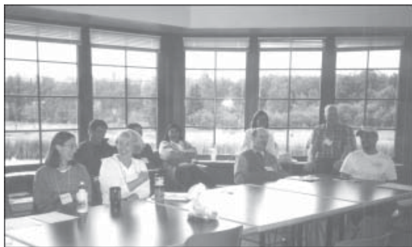
Bad River Watershed Assn. Benchmarking Workshop.

"I don't think we would have had nearly as successful an 'annual' event without the board training. We put out a huge 'donations' box and got some! We all wore our T shirts and sold some... we got front and back page picture (newspaper) spreads and several good stories. Thanks for everything."