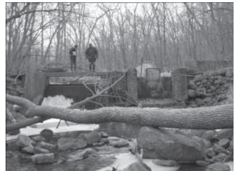
One of the Boulder Creek dams that was removed this past July.