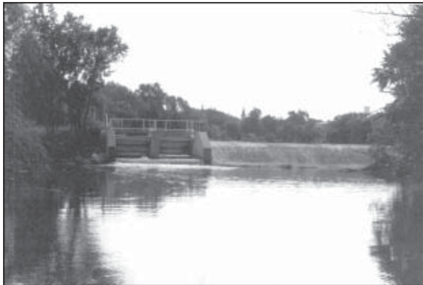
Ball Park Dam on the Mauneshia River in the City of Waterloo. The dam is slated for removal in the next year.